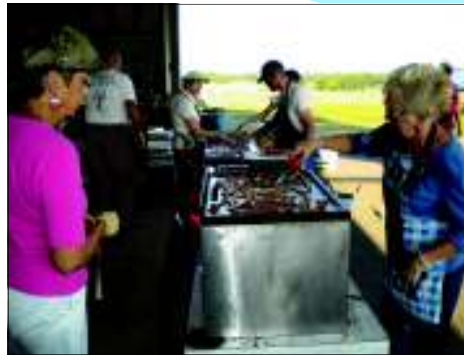
Breakfast crew grilling bacon ahead of time on Friday afternoon. It takes quite a while to prepare for about 600 people!