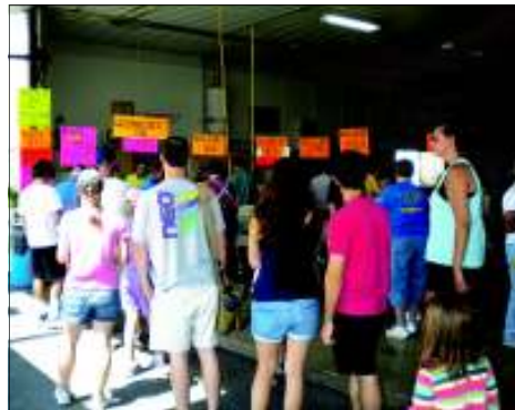
Anticipating a tasty treat from the Food Hangar Concessions

Please note that from our website you can download :