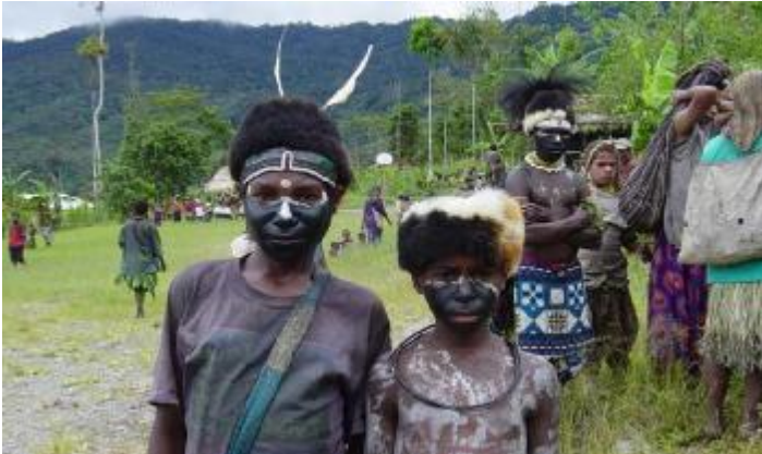
Lest we forget why we are called of God to this endeavor...

Dear Praying and Supporting Friends, Perspectives... in a “real” world of need... www.questaircraft.com Check the ‘About Quest’ icon and then Kodiak partners. The user name is kodiak and password is firstflight.